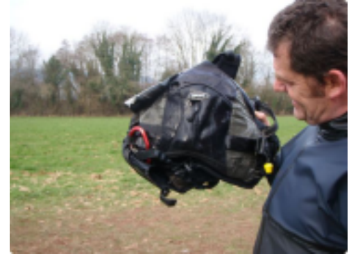
Aren't these supposed to bend? A frozen BA on the

The following day a few more paddlers appeared and we set off to do the River Usk from Tal y Bont. The weather had warmed up a bit although